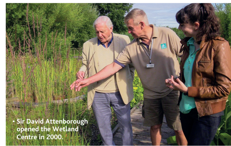
Sir David Attenborough opened the Wetland Centre in 2000.

One of the best seasons to visit the centre, as some of the UK's most attractive ducks arrive, with teal, wigeon and shovelers easy to spot. Look carefully and you might even spot one of the shyer species, the water rail, in the waterside vegetation. Meanwhile, the enigmatic bittern enables many visitors to see this normally retiring bird close up and personal.